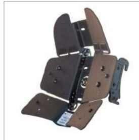
Adjustable Shell for Kyphosis applications – maintains pelvic support, and maximizes back surface contact for even pressure distribution.