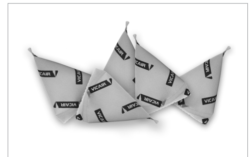
The Armadillo with Vicair Technology utilizes SmartCells inside the back support compartments. These cells move with so little friction that the effect resembles the behavior of a viscous fluid.