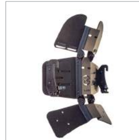
Adjustable for Lordosis or bariatric applications – can adjust to accommodate the gluteal shelf area