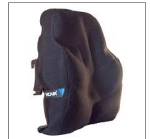
Breathable Stretch Fabric Cover