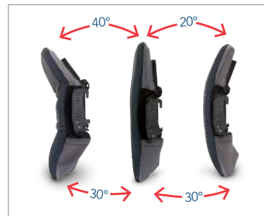
Able to wrap around the curve of the spine for users with Kyphosis and other unique spinal positioning needs