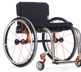
Manual Wheelchair $155/month