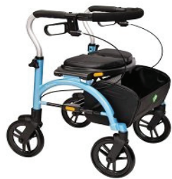
4 Wheel Rollator $60/month