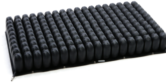
ROHO Mattress Section $177/month