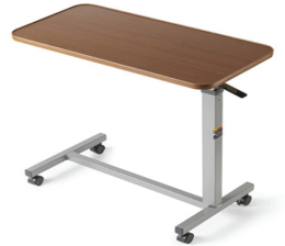
Overbed Table $45/month