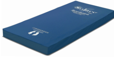
Solace Mattress (Basic Foam) $85/month