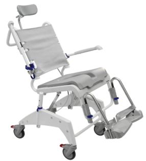
Tilt Shower Commode $140/month