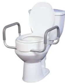
Raised Toilet Seat $32/month