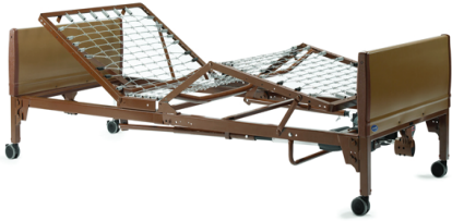
Hospital Bed $185/month

Renting is a great option for short-term requirements. You can continue to rent the same equipment that you are currently using as recommended by your therapist and pay privately for continuation of the rental. HME also has special buyout pricing where 100% of the first month's rental and 50% of each subsequent month's rental fee can go towards purchasing the equipment.