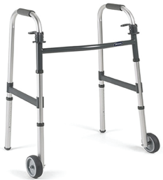
2 Wheel Walker $45/month