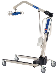
Portable Floor Lift $275/month