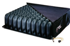
ROHO Cushion $97/month