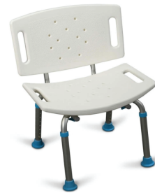
Bath Seat $32/month