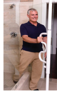
Floor to Ceiling Pole $90/month