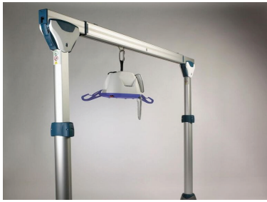
Freestanding Lift $435/month