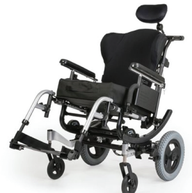
Tilt Wheelchair $260/month (need to add back/cushion) (need to add back/cushion)

More items are available for rent. Please contact your local dealer for more information or visit: