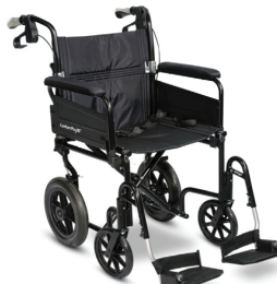
Transport Wheelchair $65/month