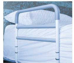
Bed Assist Rail $43/month