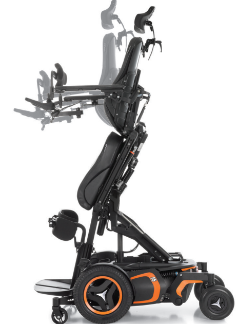
Adjustable backrest angle while in standing position