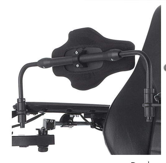
Redesigned chest bar & quick-release knee blocks for simplified adjustments