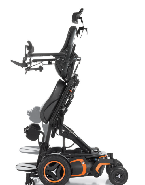
Articulating power footplate programmable footplate to fine tune height for ideal standing position