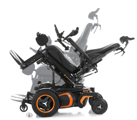
Unprecedented 50° tilt with standing functionality