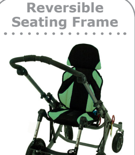
Reversible so the user can face away from or towards you

Provides adjustability for added comfort and daily living (80° to 170°)